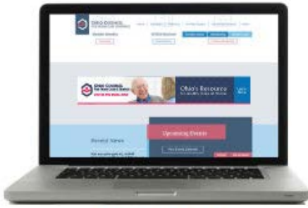
Banner Ad Size

Advertising on the Ohio Council for Home Care & Hospice Website is now underway!