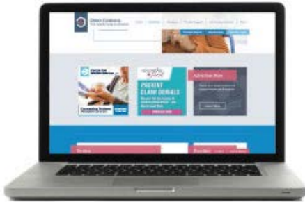
Box Ad Size